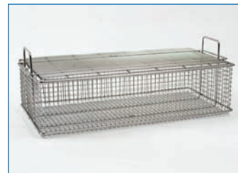
Open Basket with Handles and Retainer Top