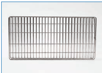
Petri Dish Insert