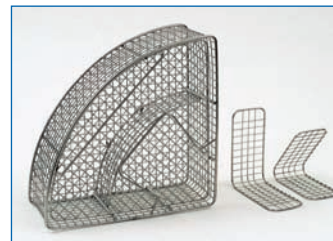
Test Tube Baskets and Lids