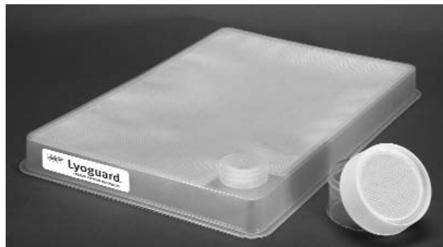
GORE™ LYOGUARD® Freeze-Drying Tray GORE™ LYOGUARD® Freeze-Drying R&D Container

Outside dimensions are approximately: 65 mm diameter by 50 mm height. The R&D Container can be filled with 5 to 60 ml of solution.