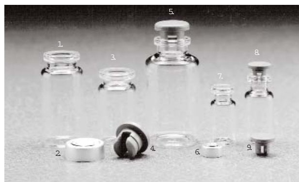
1. SV-10 2. TOS-20 3. SV-5 4. ST-20 5. SV-20 6. TOS-13 7. SV-2 8. SV-3 9. ST-13

After freeze-drying, the stoppers are mechanically inserted into the vials to vacuum seal the sample. For maximum protection against accidental removal or long-term vacuum retention, clamp the stoppers to the lip of the serum vials using aluminum seals.