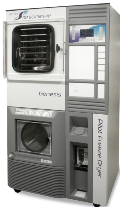
(Standard configuration Genesis 35L shown)