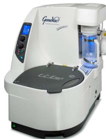
Figure 1 – Genevac EZ-2 Envi

A standard solution containing the US-EPA 16 PAHs (as defined by IARC, 1987) was spiked onto quartz fibre filters or XAD2 resin tubes and allowed to air dry. The filters / tubes were then extracted twice using 7ml DCM and sonication in the ultrasonic bath for 15 minutes at room temperature. The combined sample (14ml) had a 100µl aliquot removed. This was made up to 1ml with acetonitrile was taken and injected into HPLC-Fluorescence to provide a 100% reference. The remaining DCM had 100µl 2-pentanol added as a solvent keep and was evaporated via centrifugal vacuum evaporation in the Genevac EZ-2 Envi (Figure 1). Temperature and pressure during evaporation were controlled such that the DCM evaporates but the 2-pentanol does not, as previously described by Marsico (2006) and Massat et al. (2007).